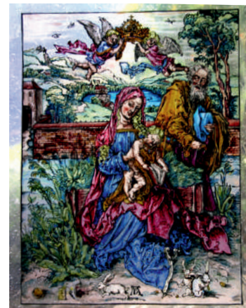
The effect of the works of art is created by the light shining through.