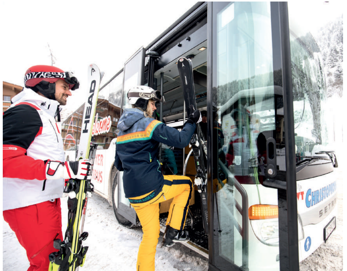
The Tux sports buses are very popular with guests.

A further step is now being taken in the quest towards zero emissions. From January 2023, four e-buses will be used on the route between Tux-Vorderlanersbach and Hintertux, as they continue to take guests and locals to their destinations free of charge. The battery-powered vehicles will be supplied with future-oriented, environmentally friendly, renewable energy and thus replace around 122,500 litres of environmentally harmful fossil diesel fuel otherwise required to cover a total of 281,234 kilometres per year. The estimated CO 2