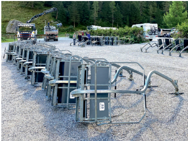
Since many regular guests have fond memories of the Lärmstange 1 chairlift, all the chairs were picked up in just one day in September 2021.

NEW MOUNTAIN FOREST TRAIL. As winter hiking is “on-trend“ and also offers an excellent opportunity to feel the delights of winter, Finkenberg Almbahnen, in cooperation with the Mayrhofner Bergbahnen cable car co., built