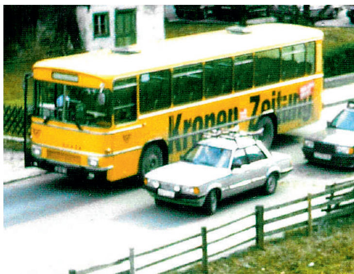
The Tux sports buses have been on the road in the Tuxteral for 50 years.

and long-standing collaboration between the Tux-Finkenberg Tourism Association and Christophorus Busbetriebs GmbH is what makes innovative projects like this possible in the first place. As a local company, the sensitive natural environment is naturally of great concern to us. That is why we have been implementing projects that contribute to the sustainable development of mobility for many years now.“