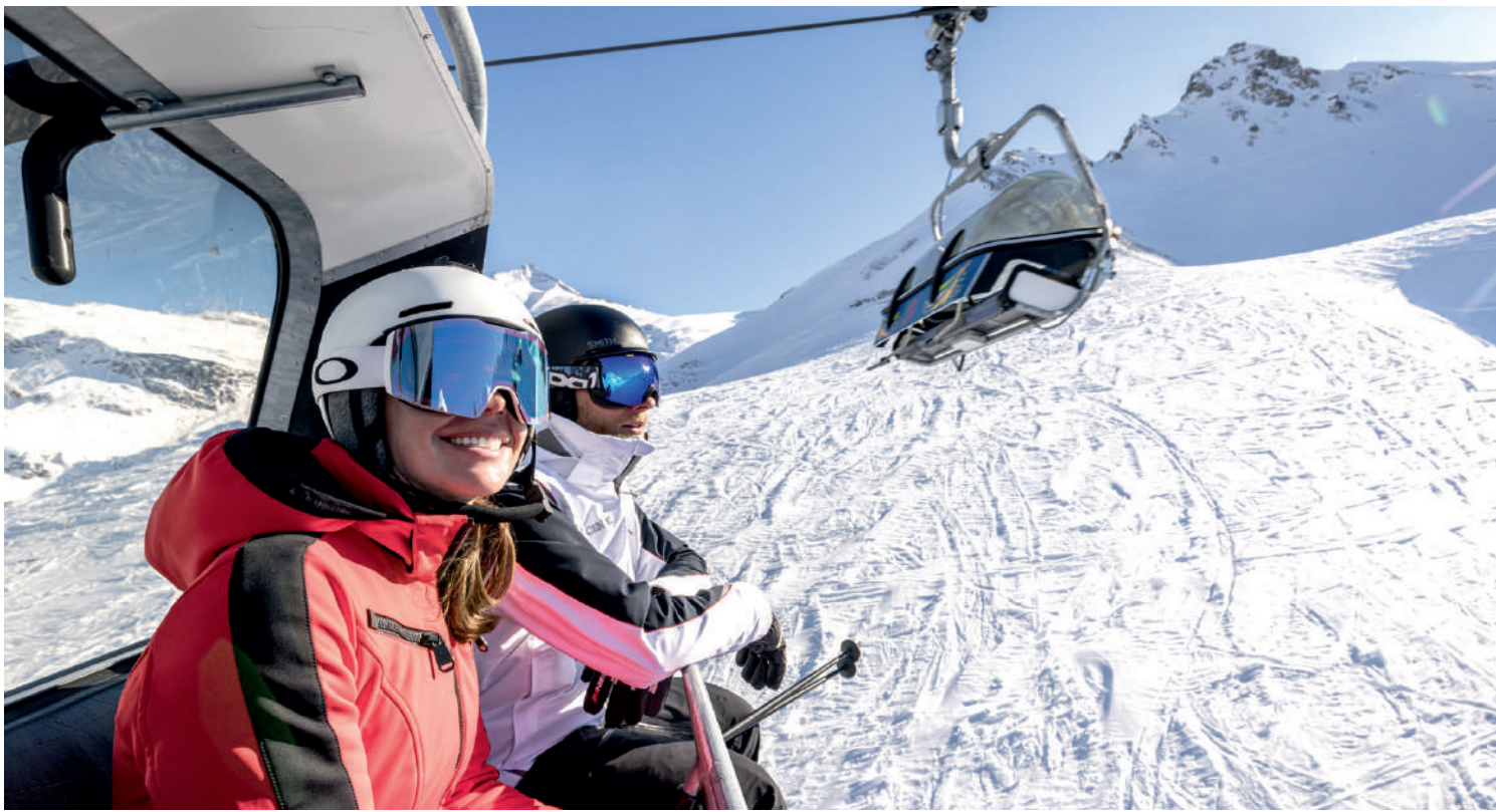
The new "Lärmstange 1" 6-seater chairlift offers state-of-the-art comfort.