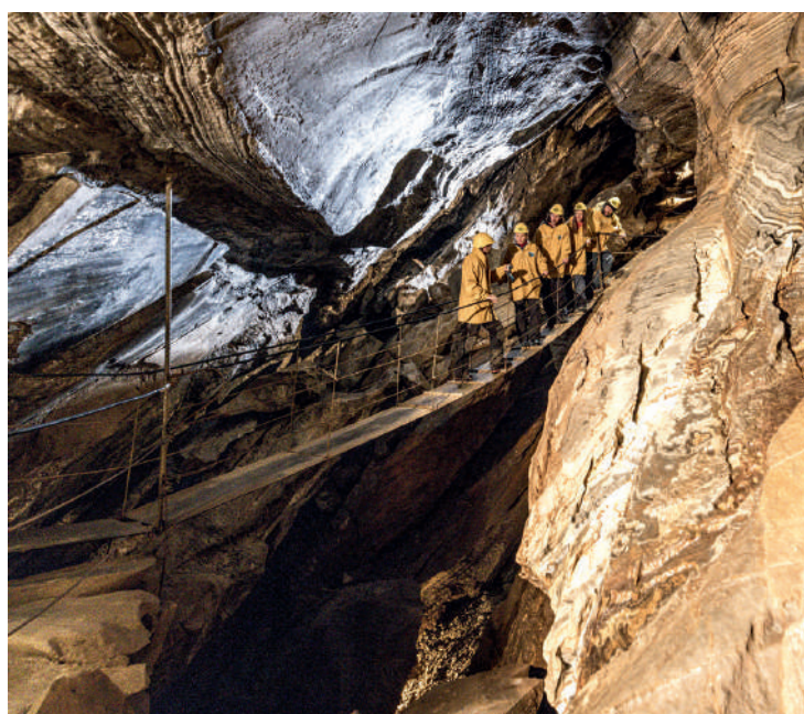
Visiting the Spannagel Cave is a truly memorable experience

FIERY FONDUE. Nach After the cave tour, the table is already set in the Spannagel-