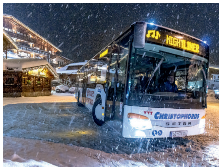
The Nightliner buses are also very well received.