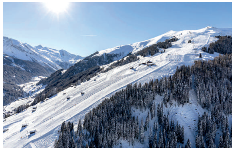
The Eggalm descent offers everything that skiers like.