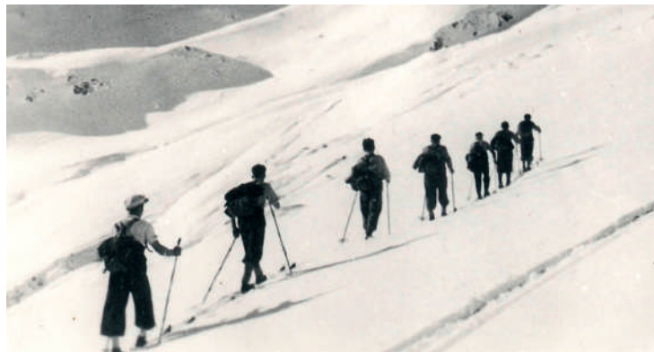
When there were no ski lifts, all of the skiers were required to ascend the slopes first.